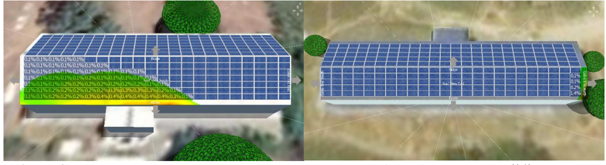
Figure 3. PVSOL shading analysis of VC Building South (left) and Lecturers' Building Eastern Façade (right).

The values of diesel consumption reduction come from a comparison performed by HOMER between the solar system of each scenario and a base case, where 100% of the electricity comes from a single diesel generator. The value of CO2 emissions saved comes from a later environmental analysis using indicators obtained from UNEP reports [6]. The optimal system for each of the options has been chosen as the one that maximizes the renewable fraction while making sense in an engineering point of view and being adjusted to the budget. The results will be presented to the country office to choose among the options.