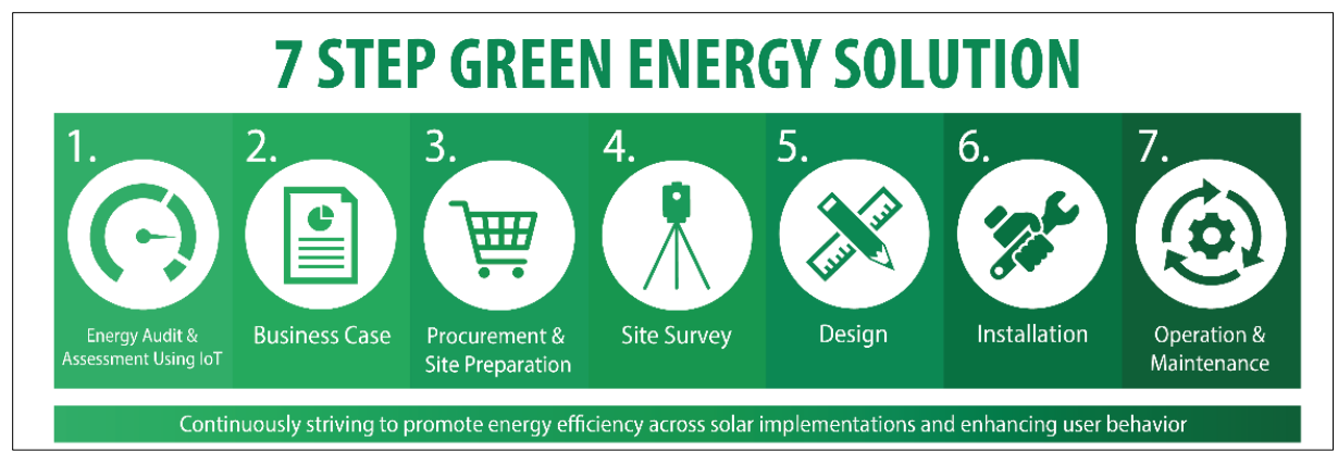
Figure 1. 7-Step Green Energy Solution Process Overview [3].

The results obtained are combined with cost data of previous UNDP projects and UNEP verified emission factors to calculate the total system cost, payback time and CO2 emissions. All the results are included in the Business Case Document and informed to the country office.